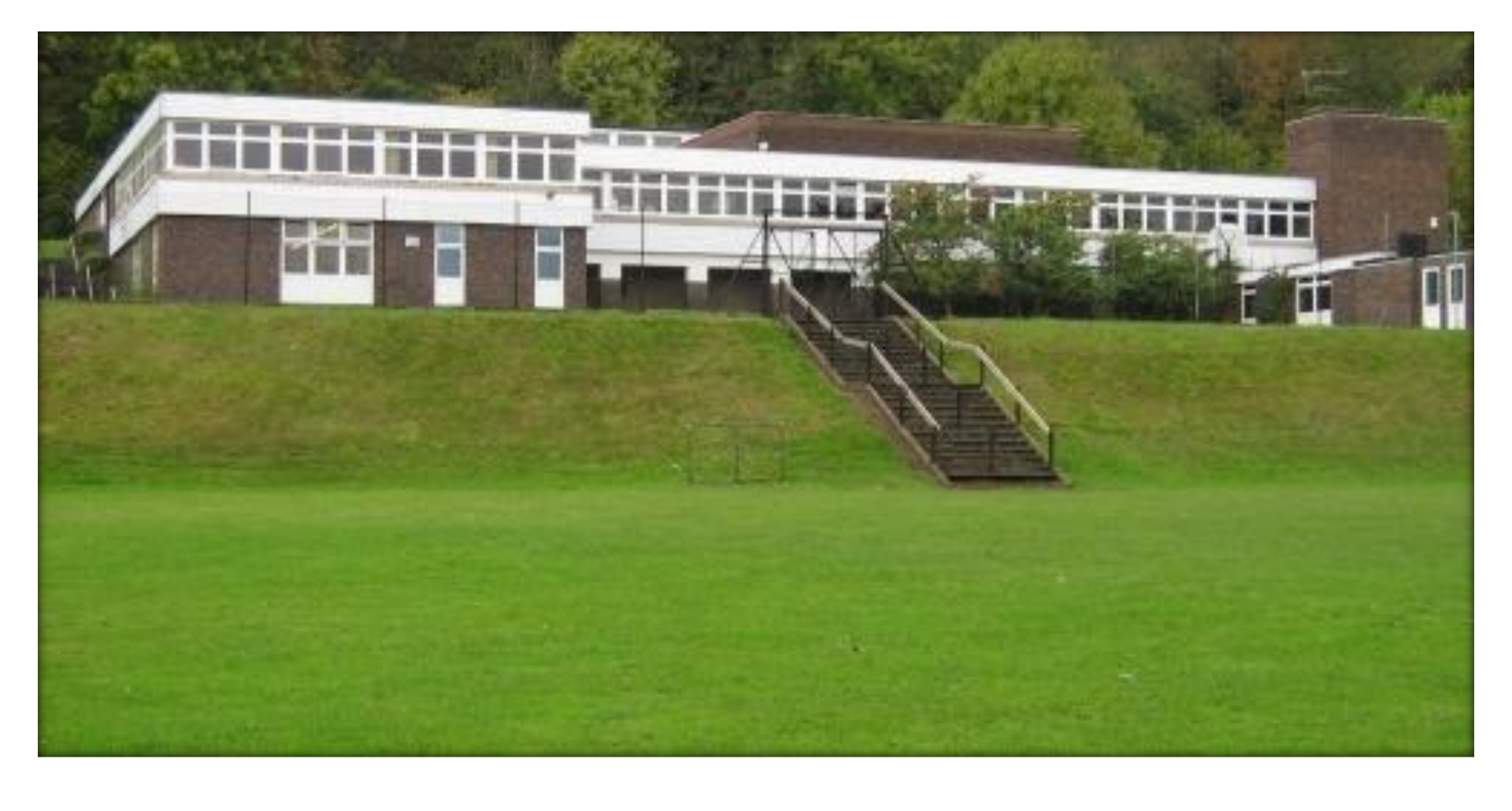
This is Loudwater Combined School.