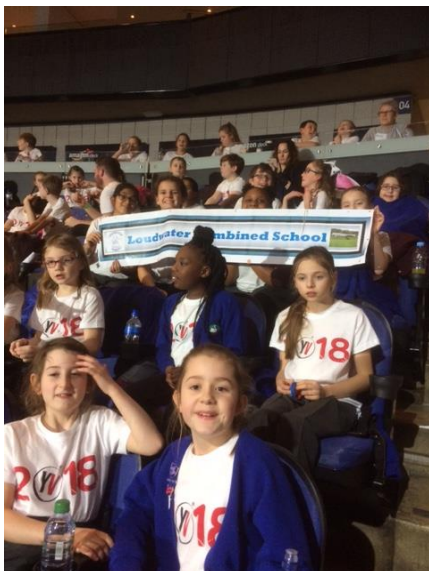
O2 Young Voices Choir Performance